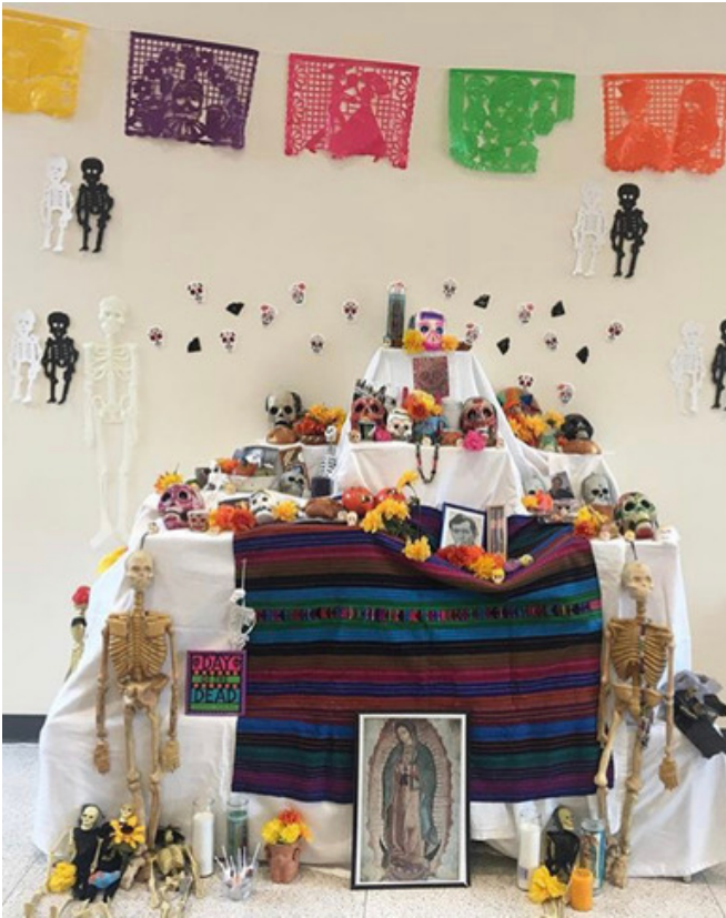
Día de los Muertos altar at the Sojourner Truth Library, organized by the Spanish Club.